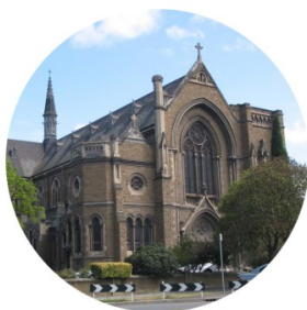
St. Mary Star of the Sea

Emerald, Healesville, Templestowe, Andersons Creek and Lillydale cemeteries.