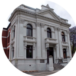
Kensington Town Hall