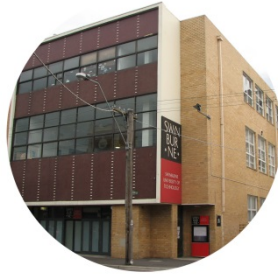
The Ethel Swinburne Centre