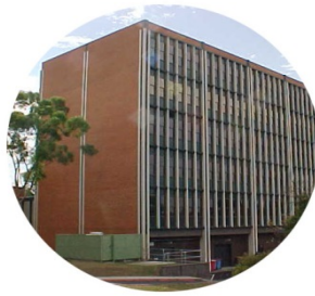
Post-War Heritage survey