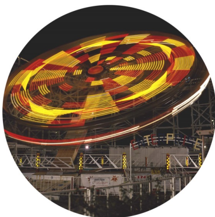
Luna Park, St Kilda