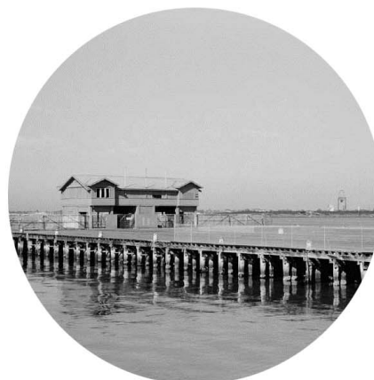
Station Pier, Port Melbourne