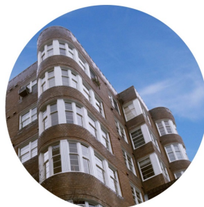
Moderne Flats, Sydney