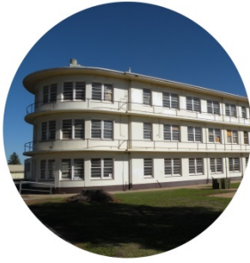
Mildura Base Hospital